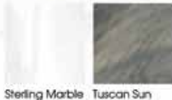
Sterling Marble Tuscan Sun