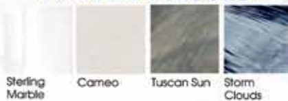
Sterling Marble Cameo Tuscan Sun Storm Clouds