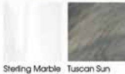
Sterling Marble Tuscan Sun